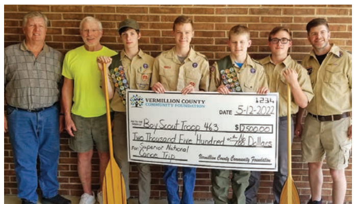
Boy Scout Troop 463 (Left to right) :