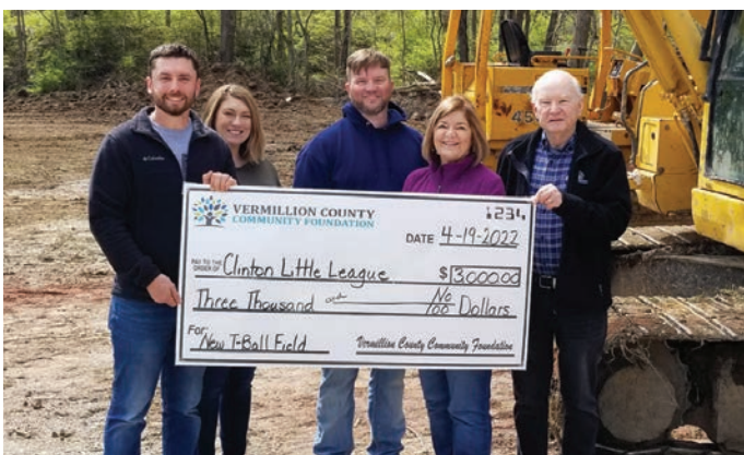
Clinton Little League (Left to right) :